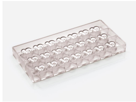
VO97 Giessform Amo Praliné Herz 10 g