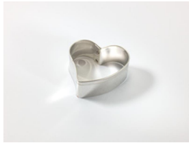
WG07 Cookie cutter, heart shaped