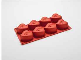
VO39 Silicon mould for 8 "Hearts"