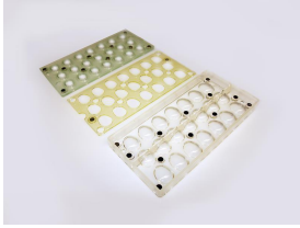
VO61 Mould Stone for pralines 3 part mould for 21 pc