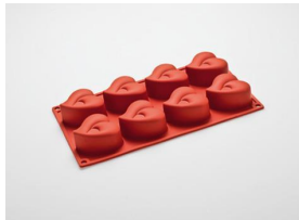
VO39 Silicon mould for 8 "Hearts"