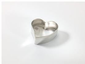
WG07 Cookie cutter, heart shaped