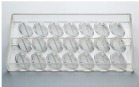
VM04 Mythen mould for pralines 10 g