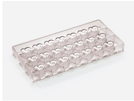
VO97 Mould for 21 pralines "Amo", of 10g each