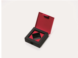
WG27 Packaging Amo for 1 praline