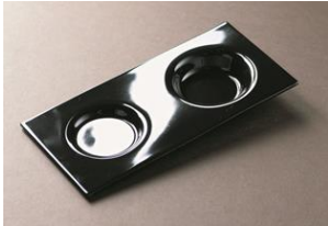
WR35 Glass plate for Xocolatl, black